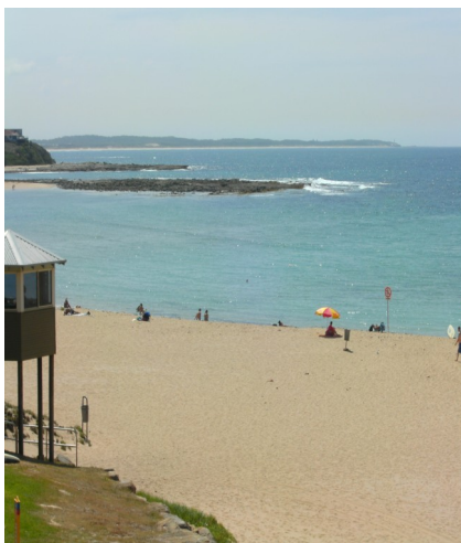
Toowoan Bay today, 12.30pm 16/3/2011

If you can help, please send an email to jdstaff@tbslsc.com.au